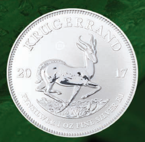
2017 KRUGERRAND SILVER PU