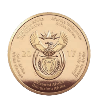
Base Metal Obverse