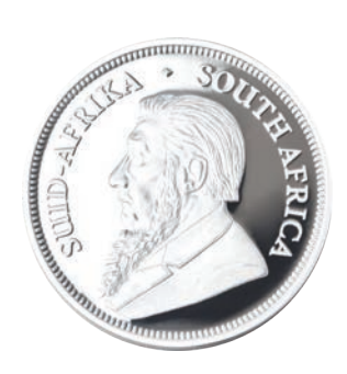
Silver Proof Obverse