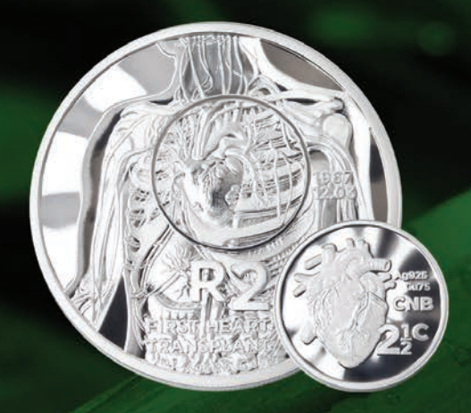
2017 R2 CROWN AND 21/2c TICKEY

The South African Mint is a leading maker of quality circulation, collectable and investment coins. We draw inspiration from our country's rich heritage in crafting some of the world's most admired coins. In 2017 we celebrated two significant 50th anniversaries: that of the iconic Krugerrand and that of the world's first heart transplant, in fine and sterling silver respectively. We also introduced our second installation of colour coins, showcasing the rich diversity and astounding beauty of the Cape West Coast Biosphere Reserve.