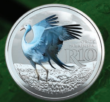
2017 R10 BLUE CRANE