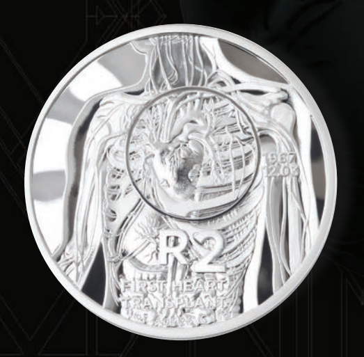
2017 R2 Sterling-Silver Crown

The coins are available individually or as a set of two which is packaged with a miniature sterling-silver mould of a human heart.