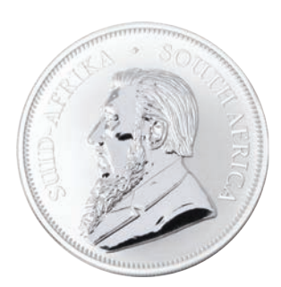
Silver PU Obverse